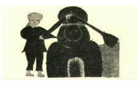
An illustration from an Arabic Manuscript in the British Museum