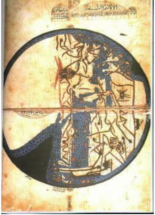
Large map of the world (which AI-Ma'mun ordered to be drawn)