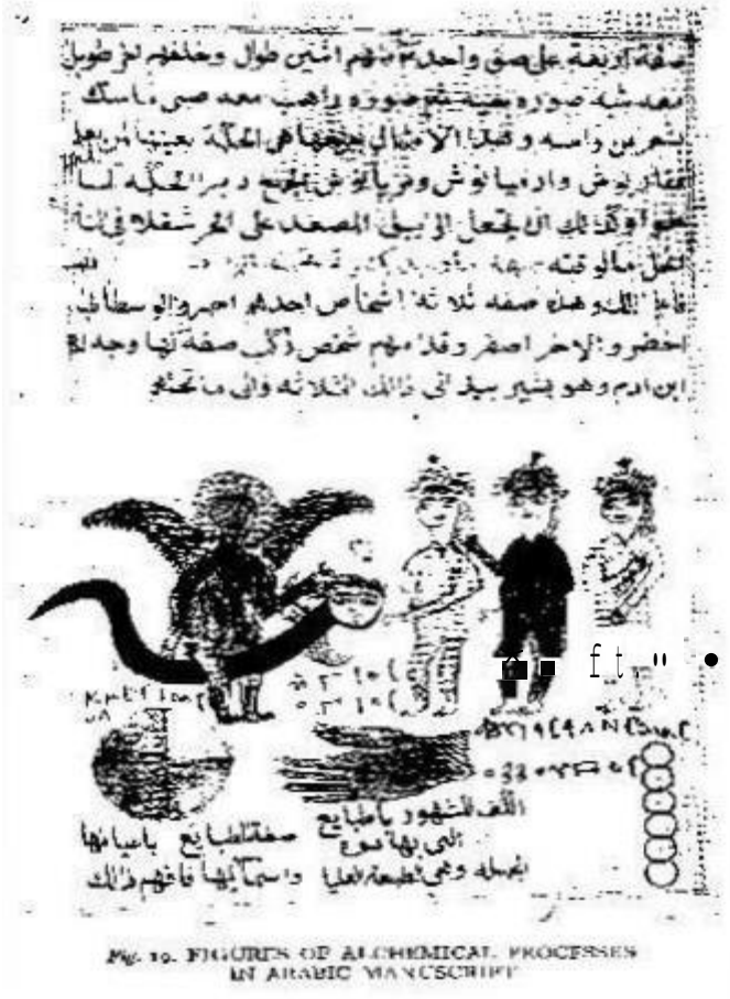
Page of one of Jabir's Chemical Works in Arabic